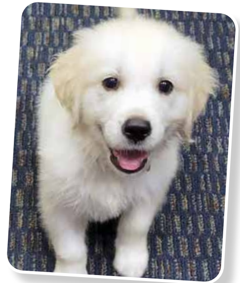
Wrigley is the latest in a long line of quality therapy dogs at Pioneer Middle School.

Wrigley (or Riggs for short) has started visiting the middle school to meet everyone. His handlers say his mother is a therapy dog in Winter Garden, FL, and his father is a champion show dog in Spain.