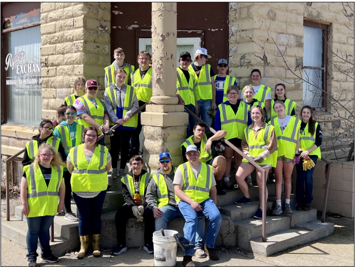
Max students pose in front of the Ryder Bank during clean-up day