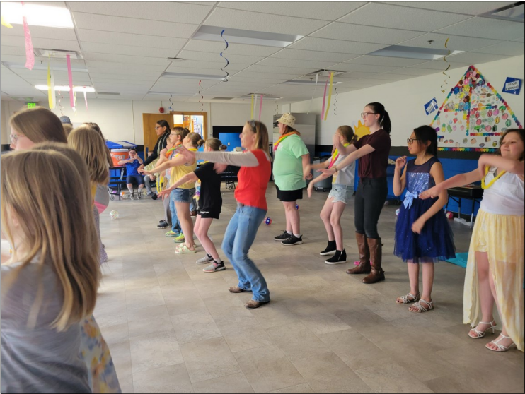
Elementary students having a great time dancing on a Friday evening in the school cafeteria.