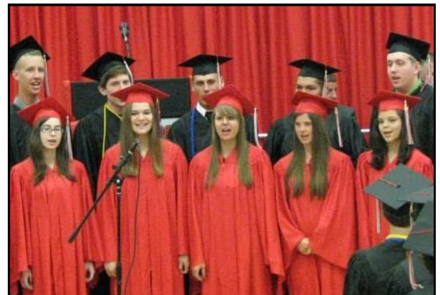
Some of the Graduation Choir Members