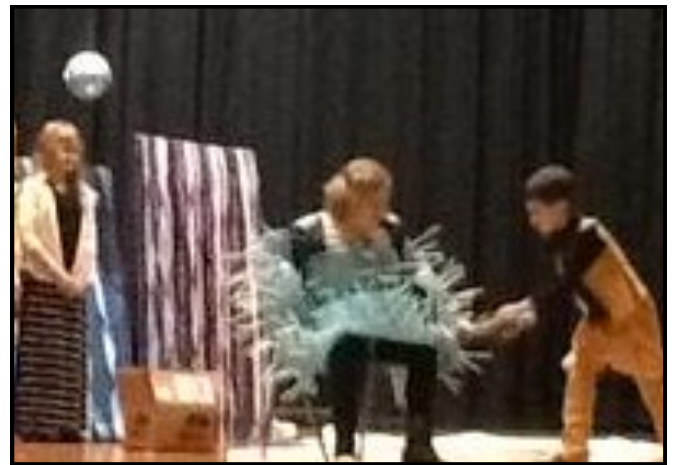
Another Oostburg third and fourth grade team performs.