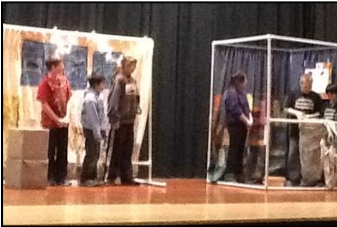
Some of the fifth grade team performing at Regionals.