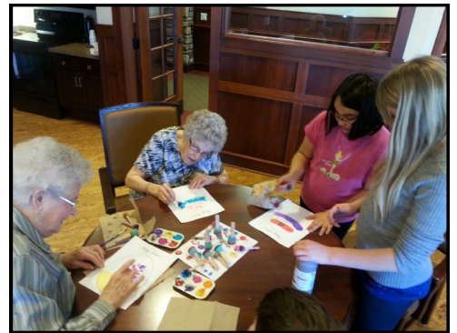
Students of Service doing crafts with the Seniors of Pine Haven.

Other SOS projects have included a food drive, toy drive (including a trip to deliver the toys to Kapco in Grafton), cleaning cafeteria microwaves each day, promoting and organizing Jump Rope for Heart (where they raised over $5,000 for the American Heart Association), and helping teachers around school (counting votes for favorite hot lunch, calculating total minutes read for the book fair, untangling and repairing jump ropes, etc.). The next project for SOS students will be creating tie blankets for Safe Harbor. Students of Service is made up of fifth graders who have a heart for serving others. They give up one lunch recess per week and choose to go to Pine Haven instead of attending their classroom holiday parties.