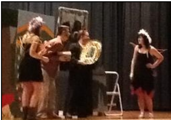
Performance by some of the high school team.