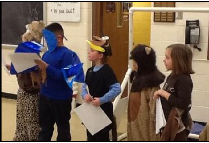
Another first and second grade team performs.