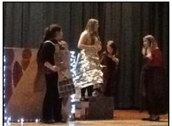
One of the middle school teams.