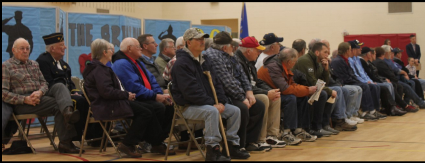
Above and Below: Some of the many Veterans honored at OES