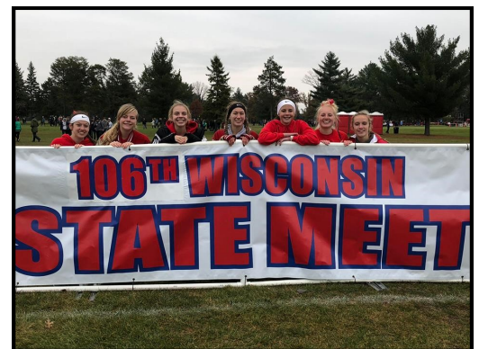
Above: The OHS Girls stop to pose be- hind a State banner