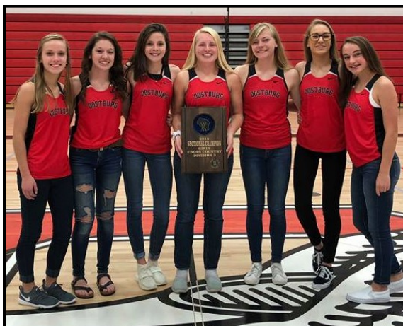
Above: Members of the OHS State Girls Cross Country Team