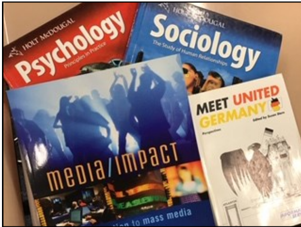
Classes come and go based on interest as well as instructors who are available and qualified to teach them. However, there are quite a few classes that used to be in Garretson that are no longer offered, but would be welcomed back greatly by the students.

Secondly, mass communications class. Now this isn't just about social media. This is about advertising strate-