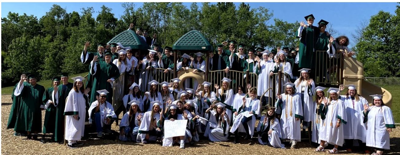
The Class of 2021 on the playground at FPE