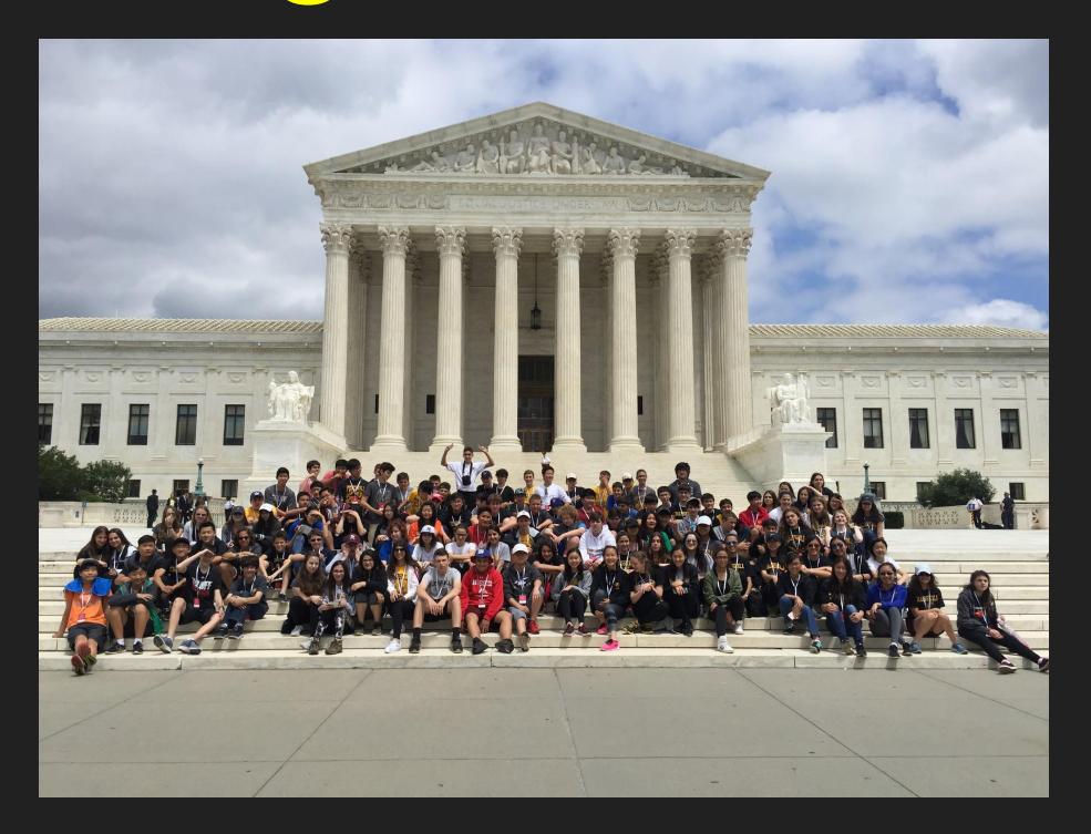
8th Grade Class Trip