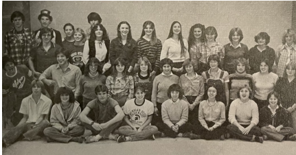
Pictured: National Honors Society Club of 1980 - 81

Dipping in on the history of Tecumseh High School clubs, a variety of organizations can be found from Farmers of Future America and Future Teachers of America to Art club and National Honors Society. In the 1965 yearbook,