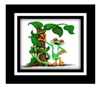
Message from the Principal to O'Connor Frog Families March 23, 2020