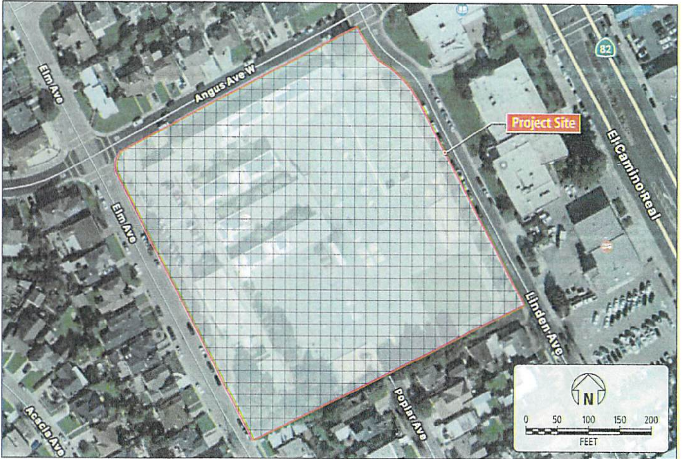
Figure 2 Aerial Photograph of Existing Campus and Project Site