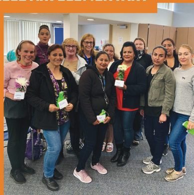
BELLE AIR ELEMENTARY

Here is a picture of some of our Belle Air volunteers. We couldn't do it without you!