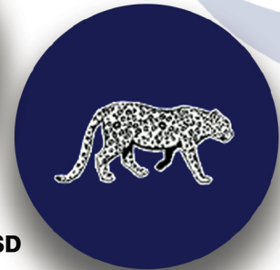
John Muir Elementary: @JohnMuirSBPSD