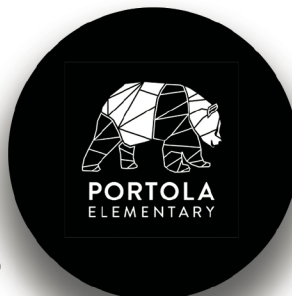
Portola Elementary: @PortolaElementarySBPSD