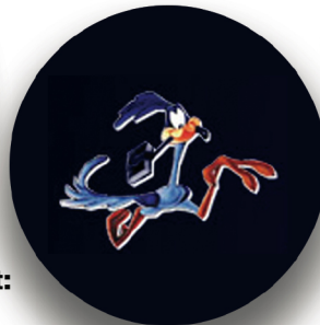
Allen Elementary: @AllenElementarySBPSD