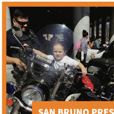
SAN BRUNO PRESCHOOL

Our Portola Elementary families are very generous! They donated over 10 large laundry baskets full of books to the Latino Family Literacy Project at Belle Air Preschool.