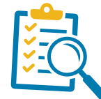
Contact tracing in collaboration with local health departments