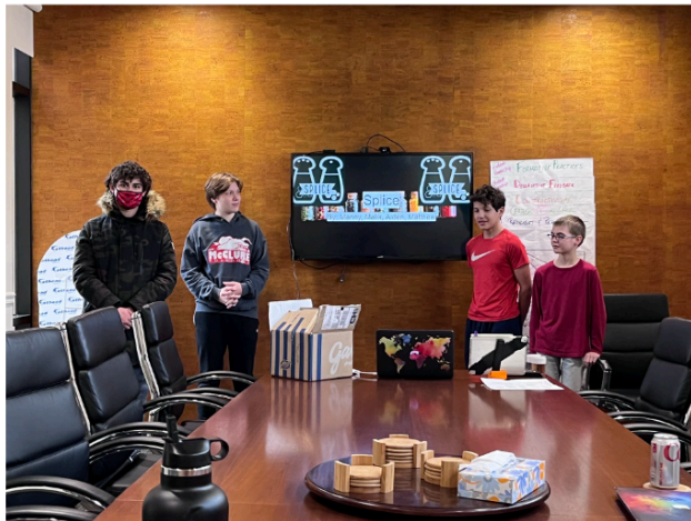
Students presenting their product.