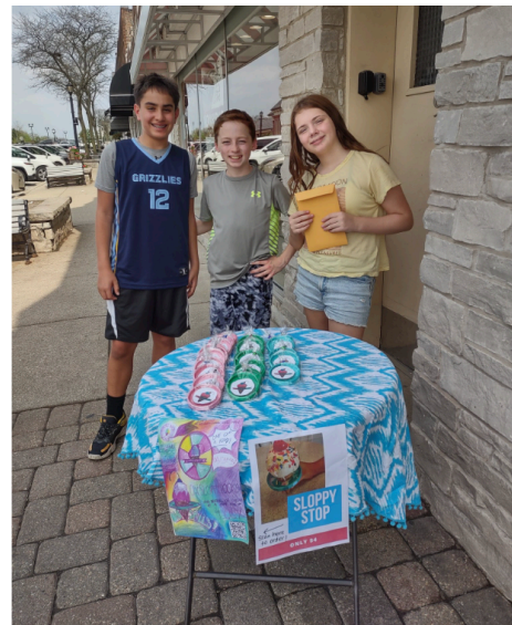
Students selling, "Sloppy Stop" a handle for your dripping ice cream cone, outside Western Springs Oberweis store.