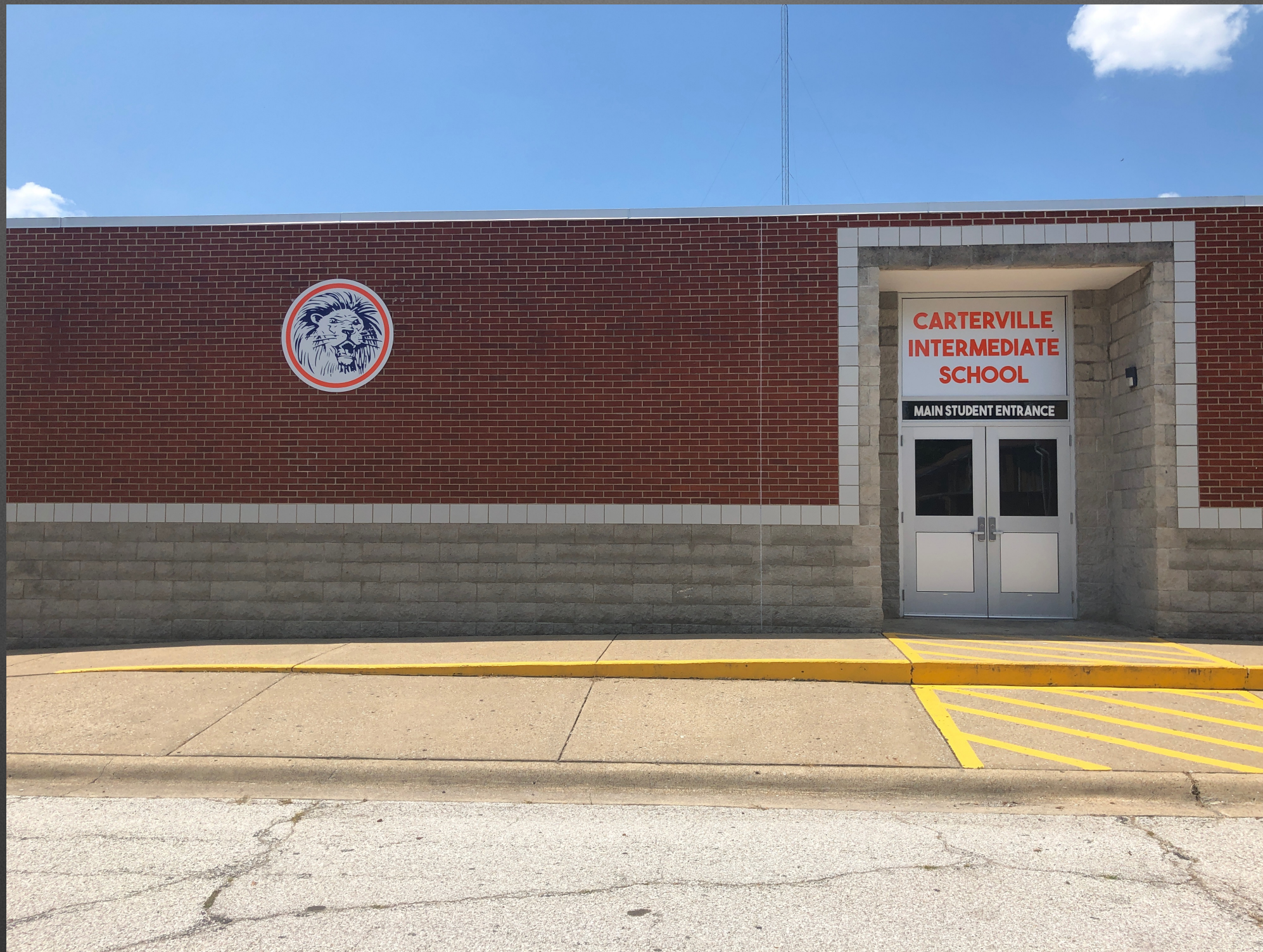
Main Student Entrance