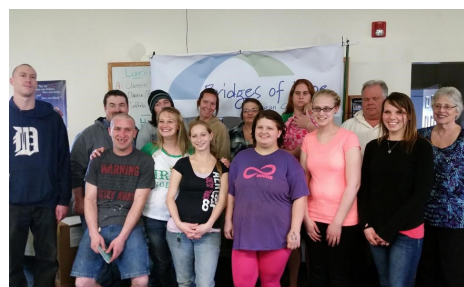
Building the Bridge Graduates, circa 2016

What is This Class About? | Bridges of Hope Allegan County is holding our spring Building the Bridge workshop at Renaissance Adult Education. The class is aimed at assisting parents and adults in the community in reflecting on their lives, setting goals, building a toolbox of resources, and community networking to improve your life the way you WANT it to be!