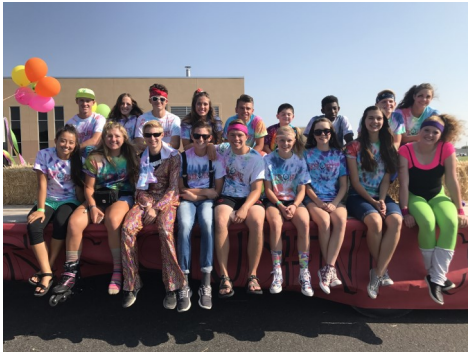
2017-18 Student Council