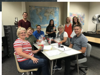
Student Council showing appreciation to our teachers