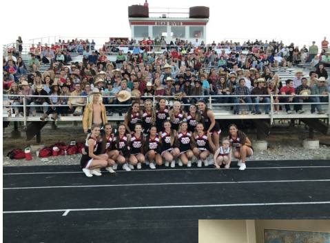
Scream Team and Cheerleaders supporting the football team