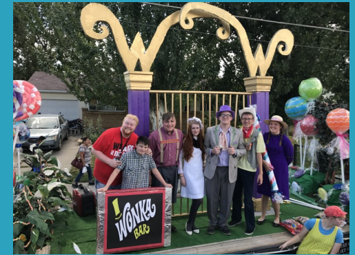
Drama club preparing for the fair parade

There are also a variety of clubs and activities that the students can choose during CLAW time.