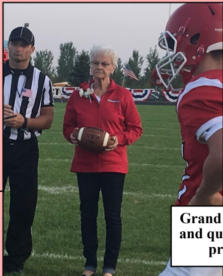
Grand Marshal duties include crowning the king and queen at coronation, leading the parade, and presenting the game ball before kickoff.