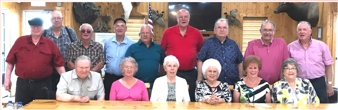
Pictured from top photo down