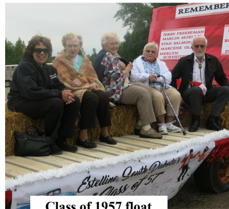
Class of 1957 float