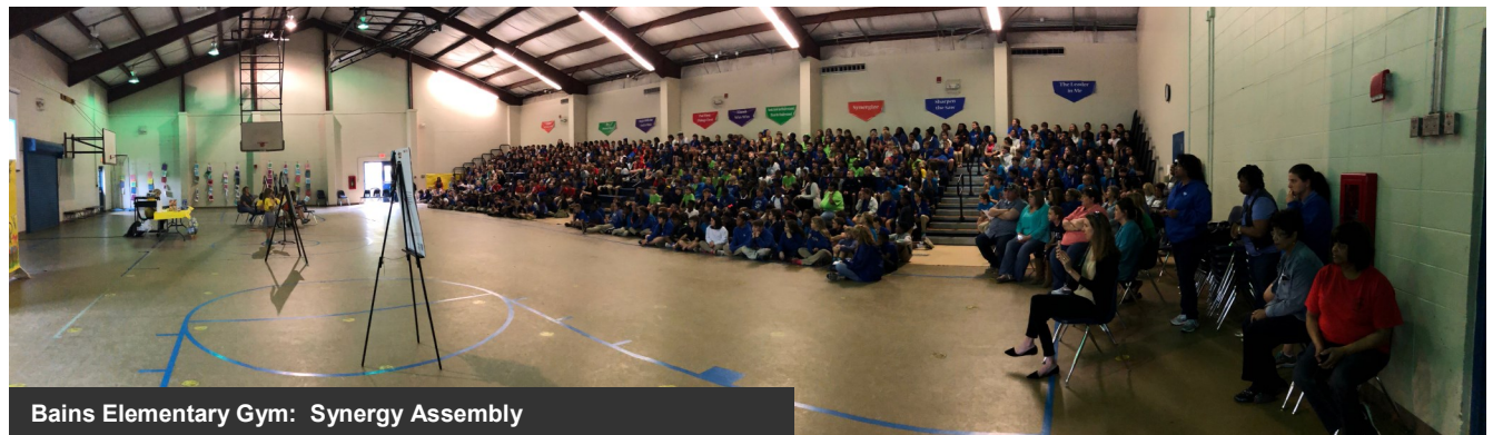
Bains Elementary Gym: Synergy Assembly