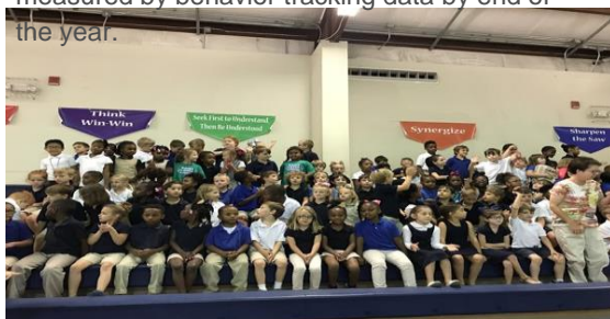
BLE Synergy Assembly

GOAL #3: At least 75% of students will demonstrate a level of positive behavior as measured by behavior tracking data by end of the year.