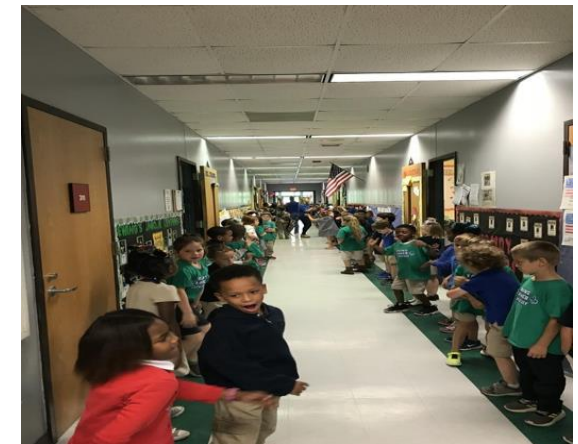
BLE Motivational Monday