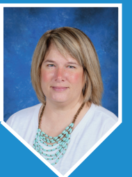
Teresa Aloe Instructional Support Building Level