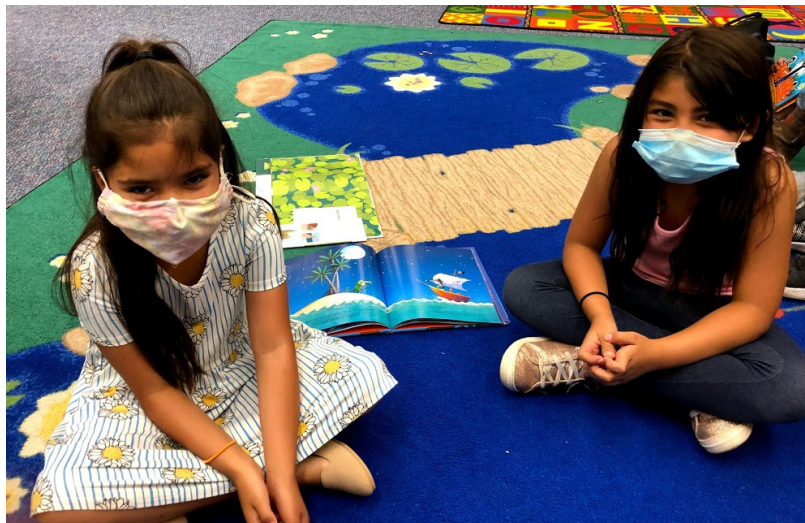
From top, clockwise: chess, guitar, acting out "The Three Little Pigs" with three wolves in grandma's bed instead one one!, library time, and the Nurturing Center.,