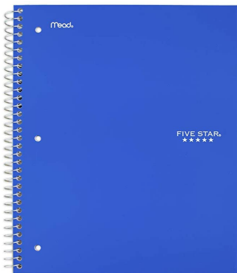
5-Star 5-Subject Notebook