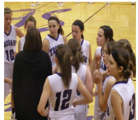
Girls A team in huddle