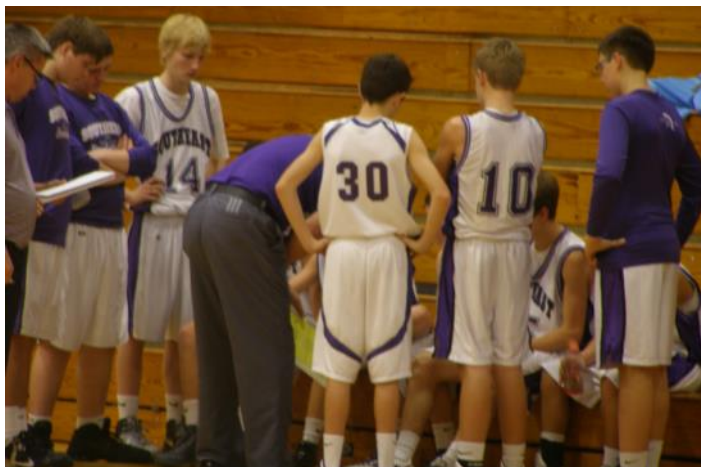
Southeast of Saline Junior High huddles in a timeout.