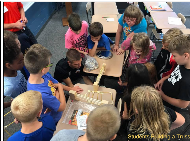
Students Building a Truss