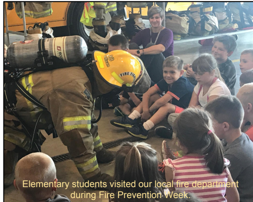
Elementary students visited our local fire department during Fire Prevention Week.

Students in the elementary will be bringing home a sign-up sheet to schedule appointments. Parents of students in grades 7-12 should call the high school office at 419-596-3871 to schedule their appointments.