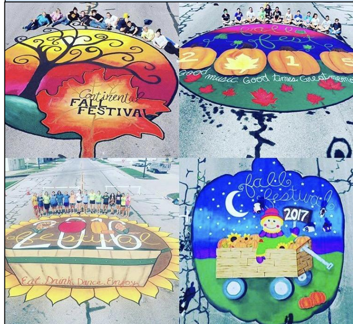
Street murals from the past four years.