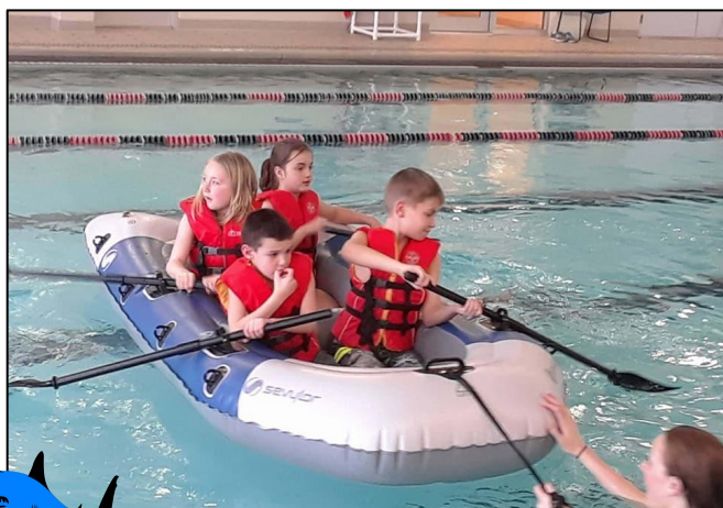
Students learning raft maneuvering skills

Our second graders recently participated in a week-long water safety course at the Putnam County YMCA. Students were bussed to the 2-hour daily training.