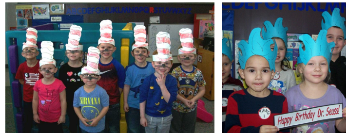
Continental Preschoolers Participating in Dr. Seuss Day