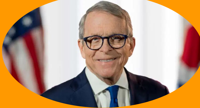
Governor Mike DeWine

“Throughout our history we have relied on our local school boards, our local families to make decisions about their schools. We're going through a very, very tough period of time, and we still rely on those families to make decisions. We give them a lot of guidance. We put out a mask order, which was not very popular with some people. With the exception of one or two schools, teachers and principals have done a great job. Students have done a great job in wearing masks and doing everything they can to be safe.”