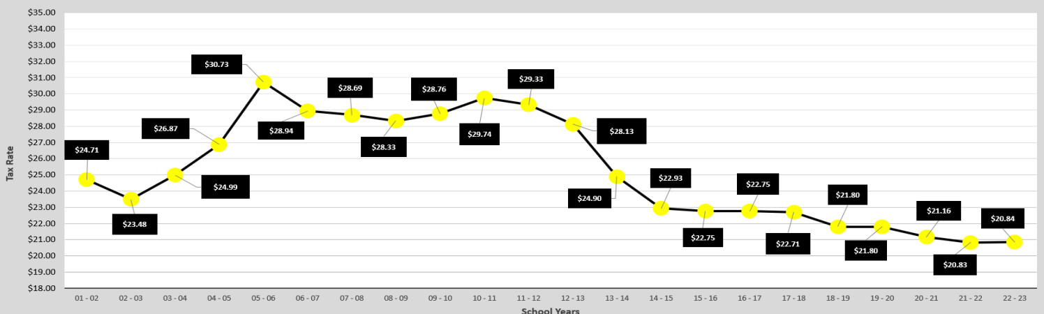
Tax Rate/$1,000 True Value