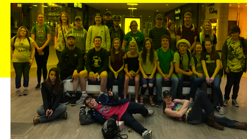
Senior Trip in Canada at the Edmonton Mall.

Overall, besides the long bus ride, the trip was fun and everyone seemed to have a good time.