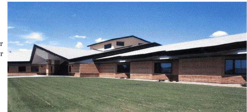
Above: Malta High School - Class B School.

The schools in small towns are often one of the largest employers. By closing or combining schools, it causes a loss of many jobs which has a huge money and economic related impact. School workers will be fighting each other to see who gets the job in the newly