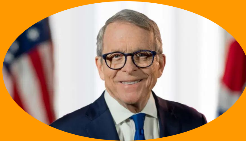
Governor Mike DeWine

“Throughout our history we have relied on our local school boards, our local families to make decisions about their schools. We're going through a very, very tough period of time, and we still rely on those families to make decisions. We give them a lot of guidance. We put out a mask order, which was not very popular with some people. With the exception of one or two schools, teachers and principals have done a great job. Students have done a great job in wearing masks and doing everything they can to be safe.”