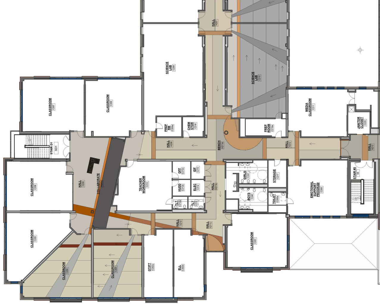
SECOND FLOOR FINISH PLAN AREA C