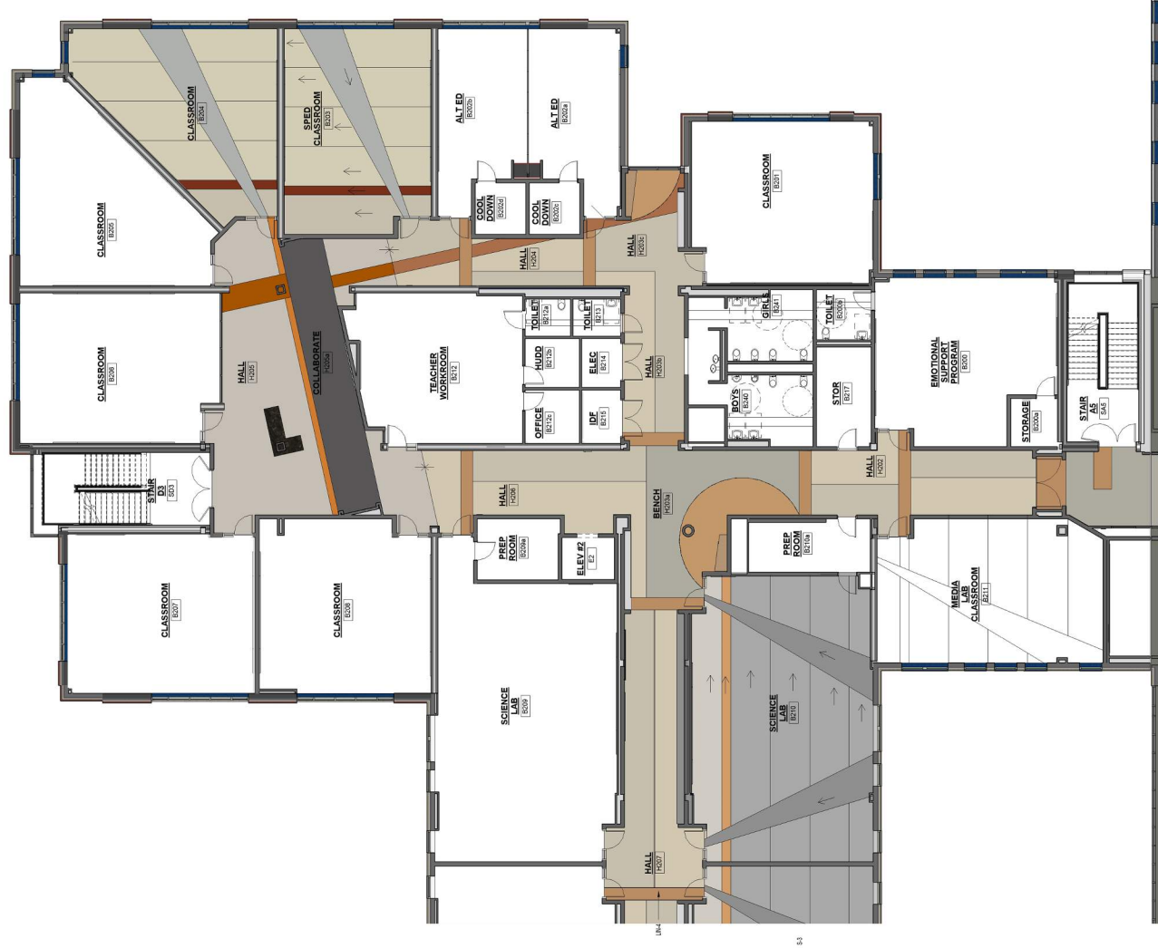
SECOND FLOOR FINISH PLAN AREA D

FORBO REAL SHEET MARMOLEUM/DECIBEL SHEET MARMOLEUM