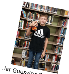
Jar Guessing Contests