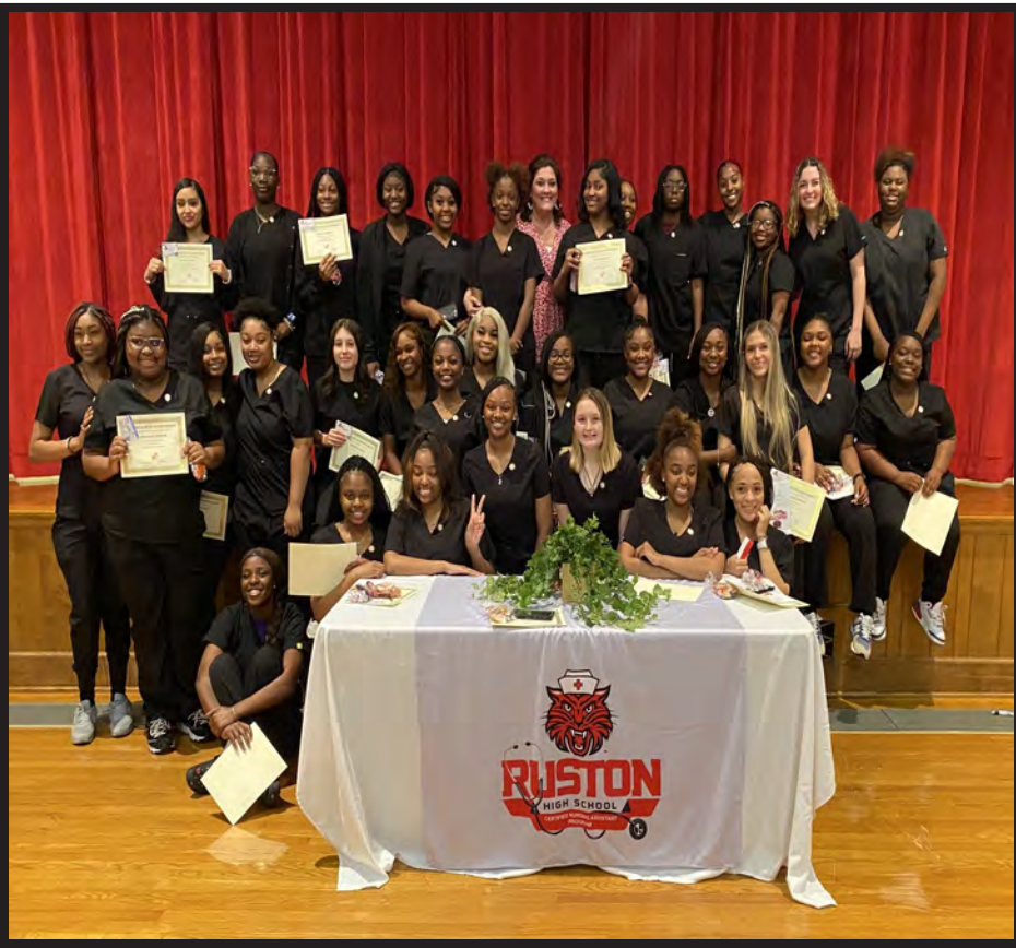
CNA certified students at their pinning ceremony.