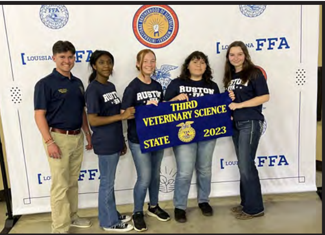
RHS FFA Veterinary Science Takes 3rd at State