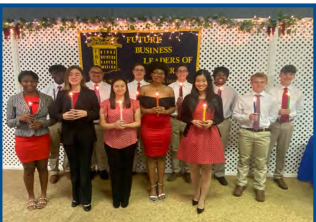
RHS FBLA's 2023-2024 Induction Ceremony

The night ended with the newly installed officers completing their first assignment job; cleaning up the facility. RHJS FBLA expects to continue their growth again next year and have even more members attending our end of the year celebration. All in all it was a wonderful night full of laughter and joy!