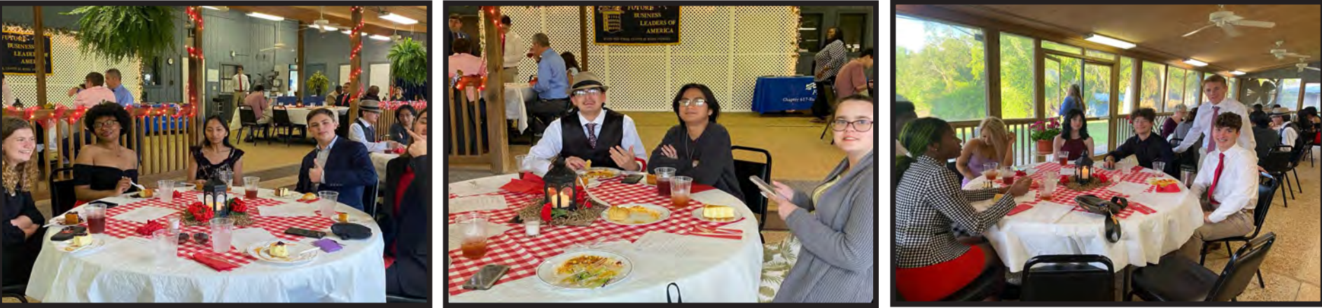
All 3 pictures above: RHS FBLA members enjoy socializing and eating as they await the recognition portion of the awards banquet