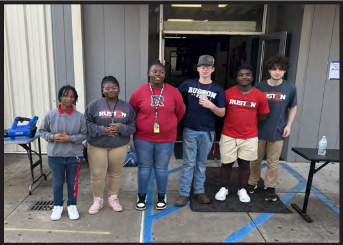
6 of the new RHS FFA 2023-2024 officers.