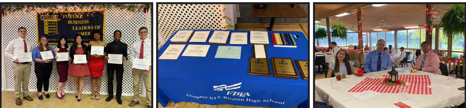
Left to right above: Past officer recognition, the official FBLA table with awards, and leaders and members enjoying the banquet