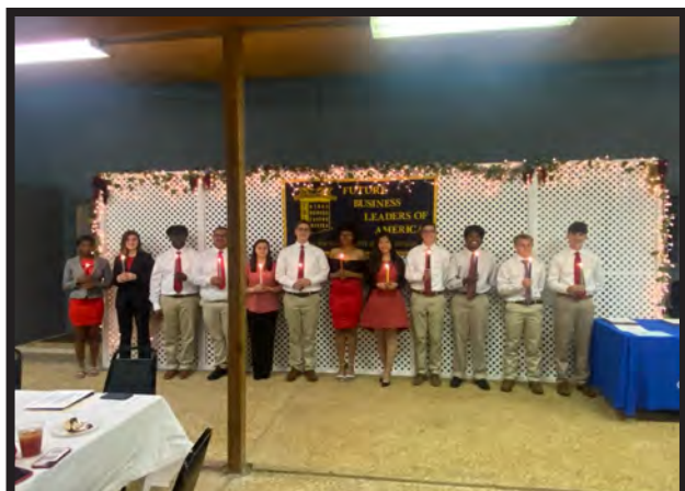
RHS FBLA's 2023-2024 Officers