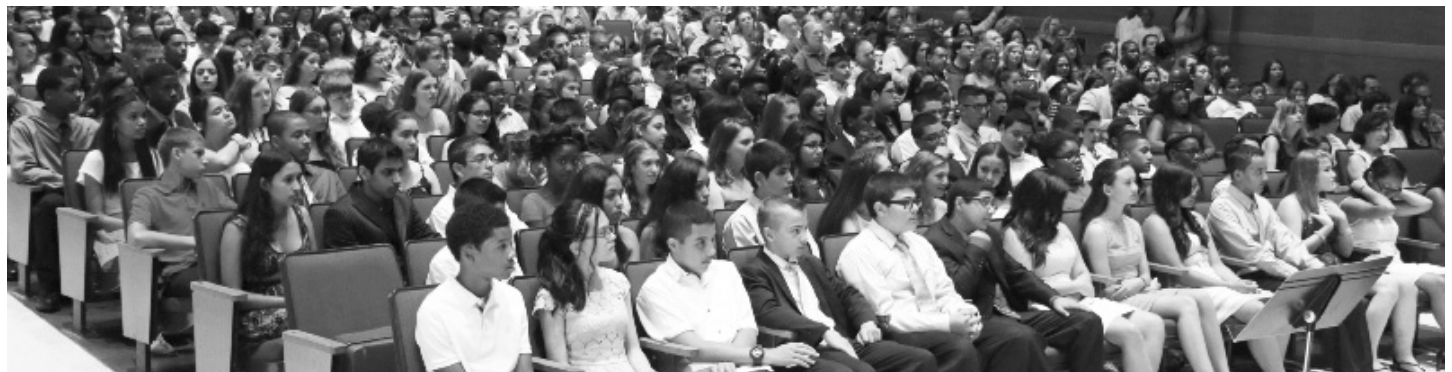
Middle School graduates will enter the final four years of their West Hempstead academic journey in September, but in June they were celebrating all they had accomplished.