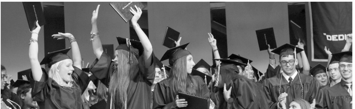
The graduates of the WHHS Class of 2014 are moving up to academic life at colleges and universities all over the country. Congratulations!