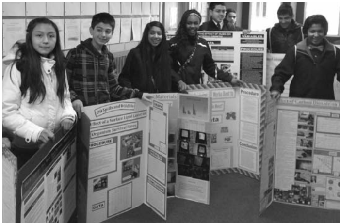
West Hempstead Middle School students excelled as they presented their science research at the LI Science Congress.

The Long Island Science Congress is a competition of student science projects sponsored by the Long Island Sections of the Science Teachers Association of New York State (STANYS). Over 300 students from more than 40 schools participated.