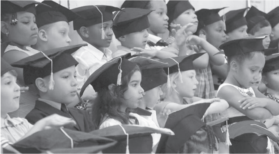
HAPPY GRADUATION! Graduation is both a solemn and a joyous event, and the honored students throughout West Hempstead – like these kindergarteners – thought about the future, then celebrated.