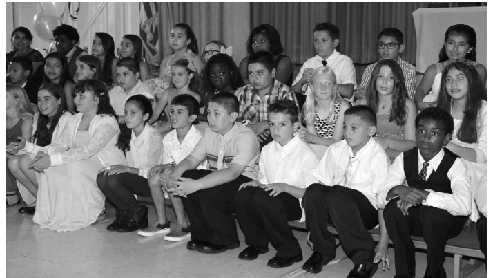
Saying goodbye to George Washington School isn't easy, but students are ready to make the leap to the middle school.