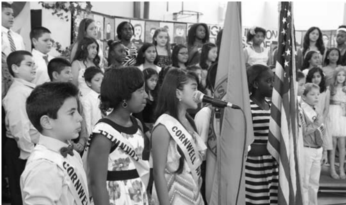
Cornwell Avenue students are proud of their school, and proud to be moving on to the middle school.