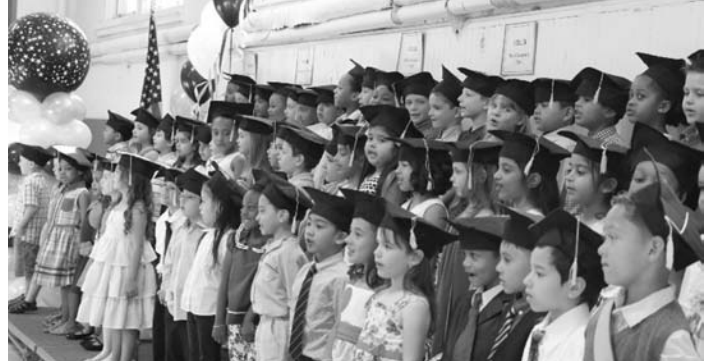
Chestnut Street School kindergarten graduation is the first milestone, and children have already visited their first grade classrooms.

The happy celebrations rang out all over West Hempstead, from the kindergarten center, to the elementary schools, to the middle school and high school, as students of all ages moved up and on to their next exciting educational adventure. They did so confidently, prepared and familiar with the different schools and academic expectations they would be experiencing come fall. Families gathered to recognize and applaud these rites of passage, and building staff and administrators smiled proudly and said farewell to the classes of 2014.