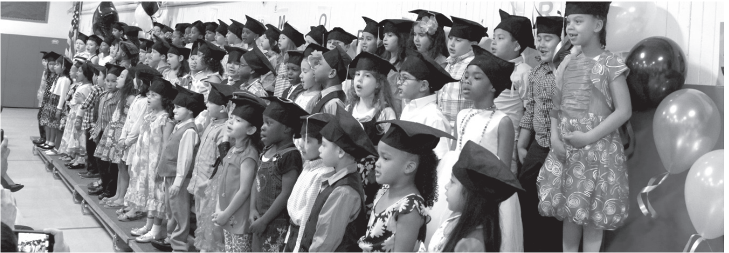
Looking every inch the graduates in their mortarboards, Chestnut Street School kindergartners moved up to first grade at the elementary schools.