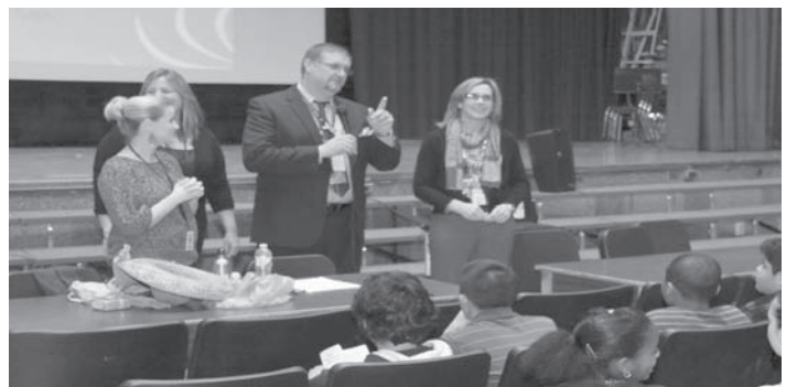
Making the big jump to middle and high school is a comfortable process for West Hempstead students; they become familiar with expectations and environments through visits and conferences -- and meet and get to know older students at their prospective schools.