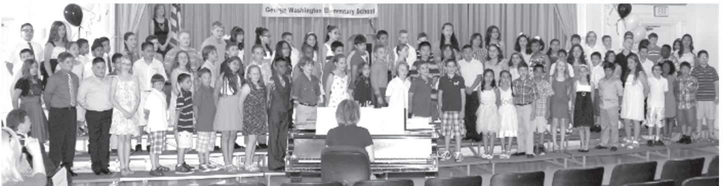
Well prepared for middle school, George Washington School graduates celebrated their elementary school achievements as they moved up.