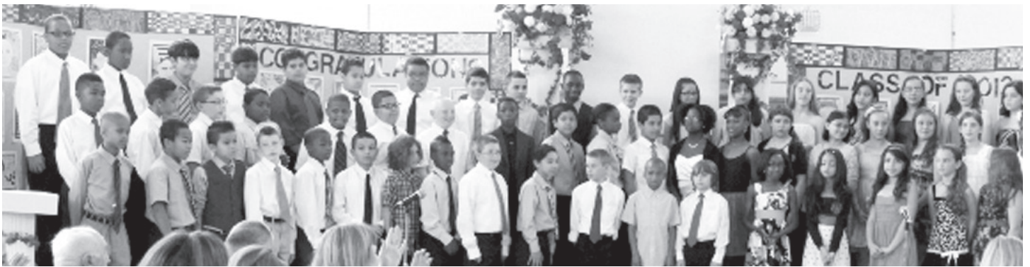
Cornwell Avenue graduates marked the end of elementary school before proud families, and looked toward September at WH Middle School.