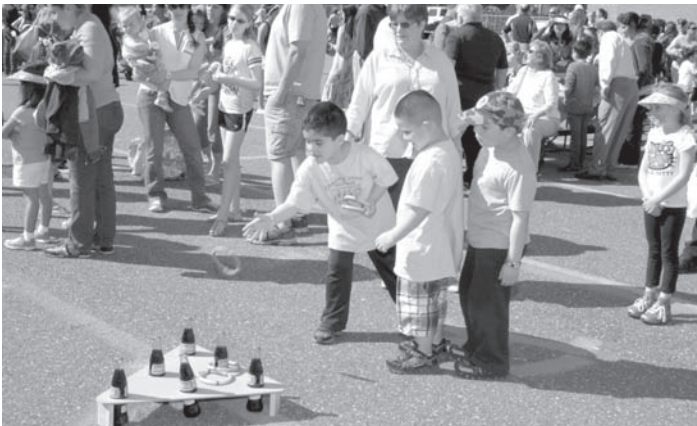
Celebrating the Chestnut Street School centennial with a game of ring toss.