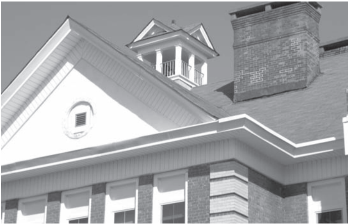
Chestnut Street School's tower is a West Hempstead icon.

I t was a vintage 100th birthday party as West Hempstead celebrated Chestnut Street School's centennial.