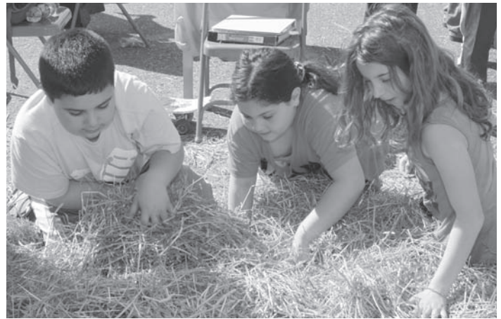
Searching the haystack at the Chestnut Street School centennial celebration.