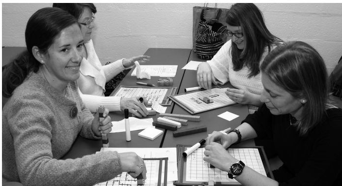
At a K-5 grade level meeting with elementary principals and the assistant superintendent in January, teachers had a hands-on experience with Common Core math strategies.