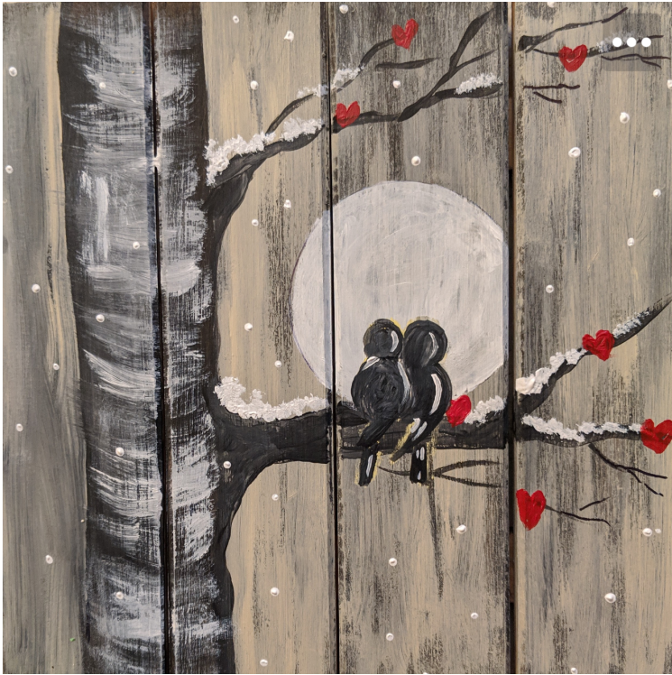
February 5th Project On Wood