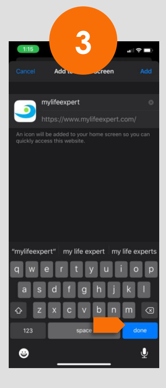
Click the blue 'Add' or 'done' button

All of this, without even visiting an app store.