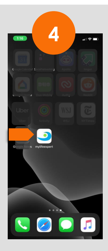
Wait about 20 sec for the download. You're now ready to enjoy MyLifeExpert