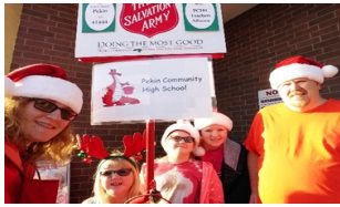
PCHS Bell-Ringing Day 2017

“Pekin Community High School is a Title One school and, as such, receives federal funds. These funds are spent in accordance with Title One guidelines and are used with the overarching goal for every child to meet state academic achievement standards. Title I provides the programs and resources for students to meet this goal.”