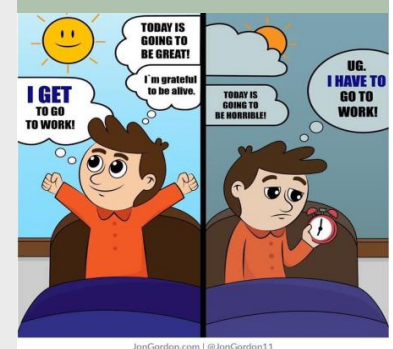
"RISE AND SHINE vs RISE AND WHINE Every Day It's a Choice"