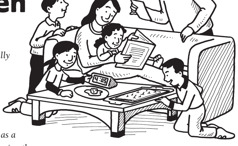
Editor's note: Guidelines are changing rapidly. Make sure to follow all local, state, and federal laws and recommendations on social distancing and other practices when using these ideas.

As a parent, you may feel overwhelmed and uncertain about what to do. Use this guide as a starting point for supporting your youngsters during the coronavirus crisis.