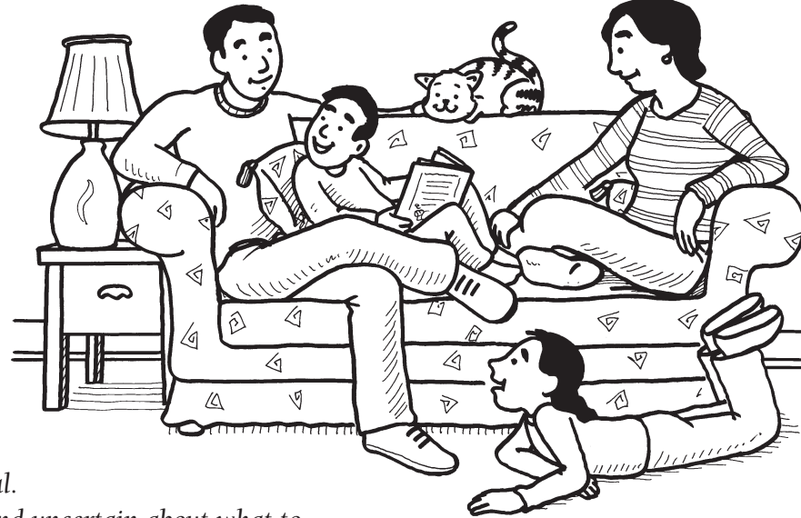
Editor's note: Guidelines are changing rapidly. Make sure to follow all local, state, and federal laws and recommendations on social distancing and other practices when using these ideas.

As a parent, you may feel overwhelmed and uncertain about what to do. Use this guide as a starting point for supporting your youngsters emotionally and academically during the coronavirus pandemic.