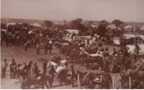
Oklahoma Land Run April 22, 1889

Oklahoma day is held on April 22, but what is Oklahoma day? Oklahoma day was put in place to commemorate when the lands of Oklahoma were opened to settlers, known as the Oklahoma Land Run. The Oklahoma land run started on April 22, 1889, after farmers and settlers needed new land for their pastures and cattle. They were allowed to cross the border at a certain time but some settlers broke the law and crossed over earlier than allowed. Those settlers were known as "Sooners" and that is also where the state