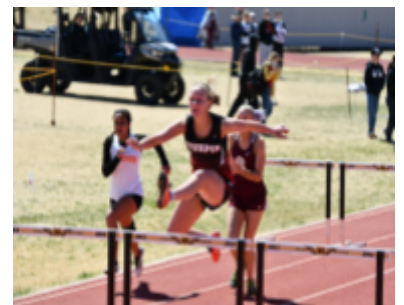
"Why is Everyone Chasing Me?"