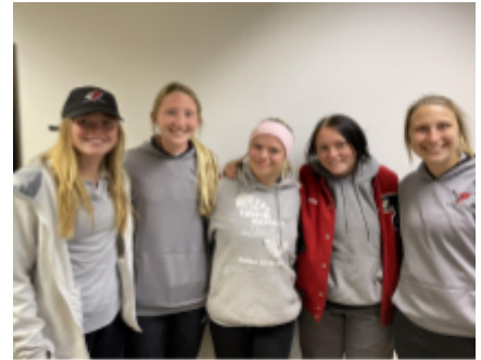
Tee Time. After a long day of golfing, the Lady Cards pose for a picture, commemorating their last meet of the season.