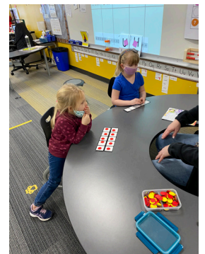
Future Kindergarteners for 2020-21