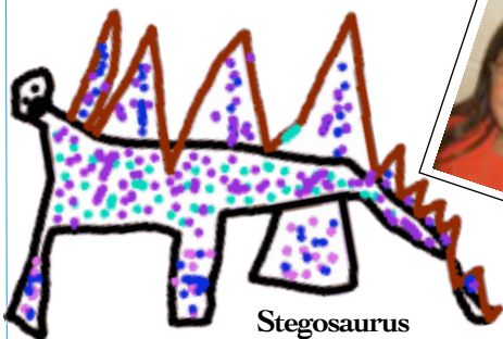
Stegosaurus --Emma, Grade 1