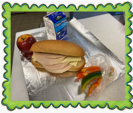
Turkey & Cheese Sub Lunch!!

Lunch Group/Snack Pack Decline Form - Memorial