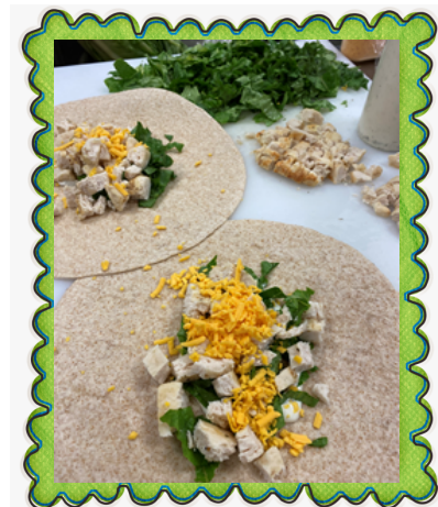
Chicken Ranch Wraps in the making!!

Click here for the April Memorial School Lunch Menu.