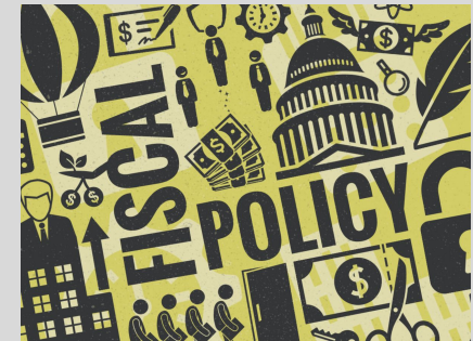
Fiscal Responsibility 2