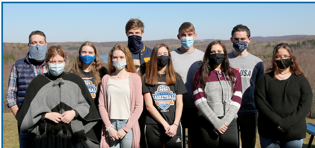
Portersville Christian School juniors taking a Butler County Community College Research Writing course are shown March 12, 2021, behind their school in Portersville.